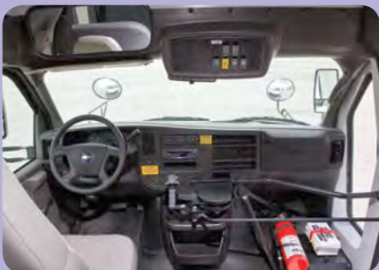
Driver cockpit and front of bus interior