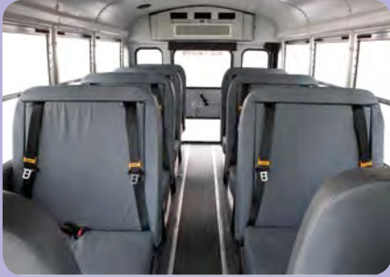
Center aisle with optional three point seatbelts

Since 1936, Thomas Built Buses has been designing the toughest and most reliable school buses in North America. That's a long time to be the benchmark in an industry as important as ours, and this proud tradition of innovative engineering isn't a coincidence. Decade after decade, our company has followed one simple philosophy: design and build the kind of school bus we'd want our own children to ride. So we put our experience to work and created one of the toughest Multi-Function School Activity Bus (MFSAB) vehicles on the road, yet one of the easiest to purchase, drive and own. And for times when you need service, we've made it simple with the nation's largest dealer network and most advanced parts and distribution center available.