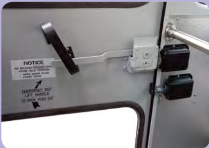
Vandalock - rear door vandal and interlock system